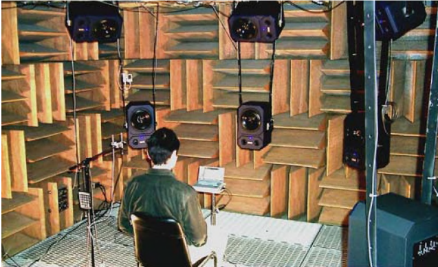
Figure 3. Eight-channel room acoustics simulation system in anechoic room.

In these new results these effects were sometimes further complicated by the addition of diffuse noise rather than uni-directional noise as well as varied amounts of early reflections and reverberant speech energy.