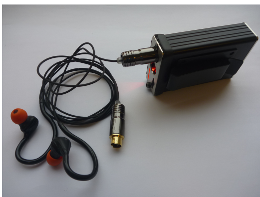
Figure 1: Overview of Auditory Research Platform, as a pair of instrumented earplugs (here equipped with a generic eartip) and a belt-pack processing unit.

chair, has commercial rights to all the developed technologies, some technologies, such as the Auditory Research Platform are made available to the research community, as open-source hardware/proprietary hardware solutions, as shown in Fig. 1. The ARP consists in a pair of custom earpieces that are instantly custom-fitted using the technology developed by Sonomax and a dedicated hardware circuit with Digital Signal Processor (DSP), Micro-controller and I/O's, as illustrated in Fig. 2. The ARP is available with complete software and hardware support for researchers interested in portable real-time audio processing unit.