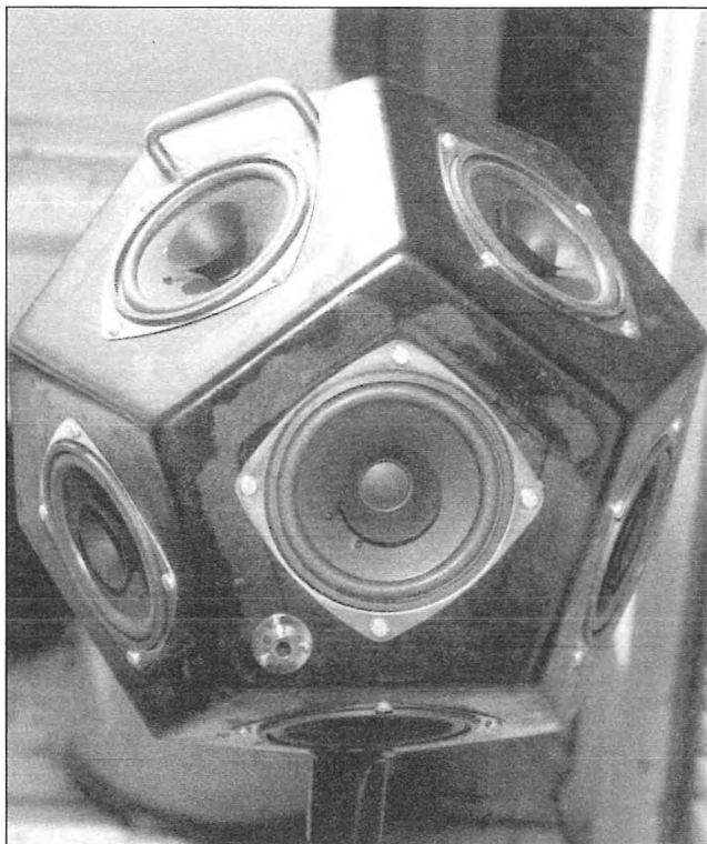
Figure 3. The completed dodecahedral speaker box with speakers mounted.