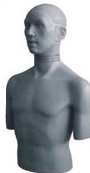
New KEMAR Manikin