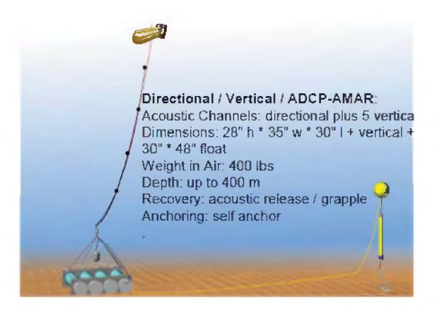
Figure 3 : Vertical array/directional hydrophone data acquisition system.

deployed by ship in the northeast Chukchi Sea in the vicinity of the Hanna Shoal, which is known to be a summer walrus gathering place (Fig. 2). The systems will be time synchronized onboard ship before deployment in early August, and will then autonomously record acoustic data at a sampling rate of 32 kHz for a 3-month period before being recovered in the early fall. The second field-work component will take place in the fall of 2009. A vertical array of omni-directional hydrophones together with a directional sensor (see Fig. 3) will be deployed outside Halifax harbour. Walrus calls will be played over an underwater transducer at a series of known locations. Data recorded in both field studies will be used to develop and test walrus call detection and localization schemes, described in the following section.