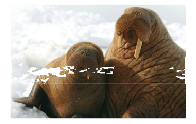
Figure 1: Pacific Walrus mother and calf.

Two approaches to acoustic localization will be considered. The first approach makes use of several independent (but time synchronized) data acquisition systems, each involving a single omni-directional hydrophone and recorder, which are deployed on the seabed at separations of up to a few kilometres. The location of a vocalizing walrus can be estimated using acoustic triangulation if its call is recorded by at least three such systems. This approach is straightforward and fairly standard, but requires the expense and effort of deploying and recovering multiple acoustic systems. The second, more novel, approach involves evaluating the use of a single data acquisition system for three-dimensional localization. In this case, the acquisition system includes a directional sensor to provide bearing, and a vertical array of omni-directional hydrophones which can be used to estimate source range and depth from the multi-path acoustic arrivals. An important issue in this approach is that acoustic localization with a vertical array requires knowledge of the physical properties of the ocean environment (water column soundspeed profile and seabed geoacoustic parameters), which may not be readily available.