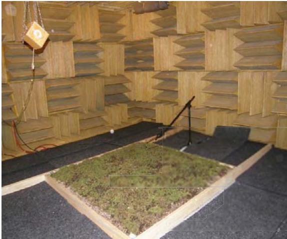
Fig.1. Set-up of instrumentation and vegetative roof test plot constructed in UBC Anechoic Chamber

plots were planted with three structurally-distinct plant species: sedums, a coastal-meadows community and grasses.