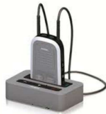
Phonak TVLink with ComPilot

These same manufacturers have developed a number of devices to provide enhanced access to audio signals from TVs, computers, music players, tablets, etc. as mentioned previously these devices can stream directly or in conjunction with a streamer, the audio signal from the source to the hearing aids. For example Oticon, Phonak and Siemens all have TV devices that work with their streamers to deliver the TV audio to the users hearing aids.