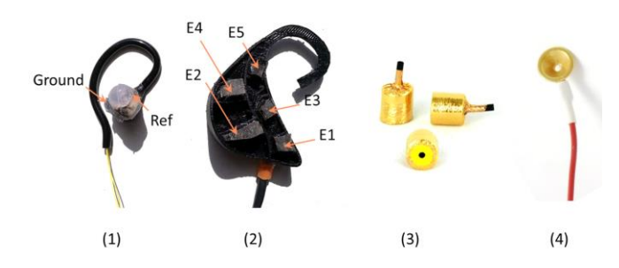
Figure 2: Electrodes used for this study: EARtrodes' custom-fitted earplug (1) and behind-the ear piece (2), gold foil electrodes (3) and gold-plated cup electrodes (4).

The EARtrodes (Fig. 2) consist of a custom-fitted earpiece which incorporates a custom-fitted earplug coupled with a behind-the-ear piece forming a 7 miniaturized wet electrodes interface. The shape of the behind-the-ear piece was designed by the authors with the help of outer ear impressions made on ten subjects in order to optimize a good contact quality.