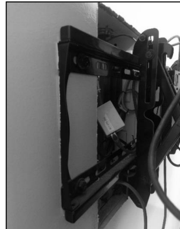
Figure 2: Wall extraction behind TV mount