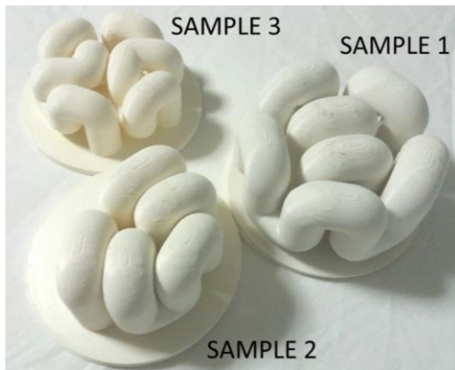
Figure 2: Photos of the 3D printed passive resonators.

filament and heats it at the head. The model is fabricated layer by layer as the melted filament is extruded and hardens. The printed layers accumulate and harden over each other, culminating in a finished model. FDM requires a secondary soluble material used as temporary structural support which is removed after the printing is submerged into hot water. One aspect about the FDM that needs to be kept in mind is that the layering nature of the FDM method causes slight undulations on the sides of the tubes, so the resonator walls may present some air pockets within each layer which may cause sound leakages and anomalies in its acoustic behavior (Fig.2). The material used for this study was low-density ABS plastic. It was decided to investigate if the acoustic results were caused by the modules having one or two openings per tube. This prompted an investigation on how sealing one end of the tube could affect the performance of the modules. Based on the three fabricated modules (Fig.2), with theoretical maximum absorption at 125 Hz (#2), 250 Hz (#1), and 400 Hz (#3), 2 mm thick plates were fabricated so that they could be attached to the face allowing to cover one of the openings.