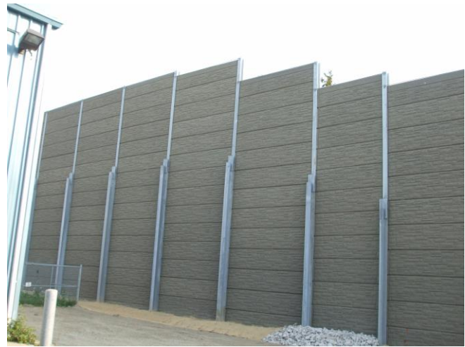
Figure 3: Facility side of noise barrier

Together with the analysis for sub-surface support of the barrier, the work for structures above the surface needed to consider wind loading. Loading required additional strength of the structural members. Final design provided larger and additional beams on the lower portion of the barrier, as shown in Figure 3. The addition structure required was hidden from view of the residences by locating it only on the facility side of the barrier.