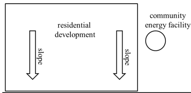
Figure 1: Residential development and facility

Sloping topography characterizes the community power generation facility site and residential development site. Figure 1 provides a plan view of the area. The development land slopes upwards quite uniformly towards the road, with a grade difference of about 10 m. The facility is on a flat area a few metres above the lower elevation of the development land and is bordered by steep upward slopes on the development and road sides. A swale or ditch runs at the base of the steep slopes. A row of tall, mature conifers is situated along the property line between the sites. Layout of the site is shown in Figure 2.