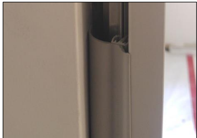
Figure 1: Photograph of PVC “zipper” seal

The modular partition consisted of an extruded aluminum frame equipped with double glazing consisting of 10 mm laminated glass separated by a 75 mm airspace from a layer of 5 mm laminated glass. The partition extended horizontally between two GWB walls and extended vertically from a carpeted floor to a GWB bulkhead in the suspended acoustical tile ceiling. This bulkhead extended vertically from the acoustical tile ceiling to the structural ceiling above in order to control noise transmission via the ceiling plenum. All four sides of the modular partition were sealed to the various surfaces using PVC gazetting, referred to as “zipper seals”. A photograph of a “zipper seal” is provided in Figure 1.