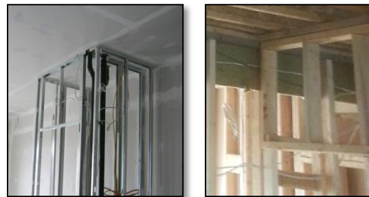
Figure 1: A (Left): studs terminate at drop ceiling, B (right): studs terminate at joists.

In wood frame buildings, typically up to 6 storeys, internal wood or steel stud walls often terminate at a drop ceiling (as shown in Figure 1a). This leaves a continuous air gap between the dropped ceiling (usually on isolating resilient channels) and floor joists above, which includes insulation. With this configuration, internal walls are structurally disconnected from the floor joists above, effectively reducing the number of adjoining constructions from the separating floor/ceiling assembly.