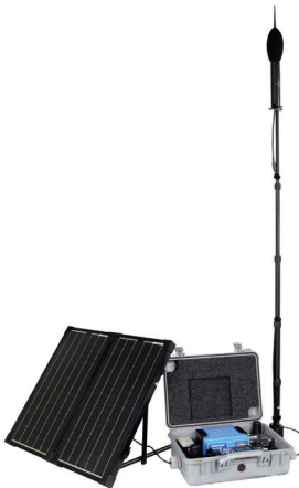
SoundAdvisor Model NMS044