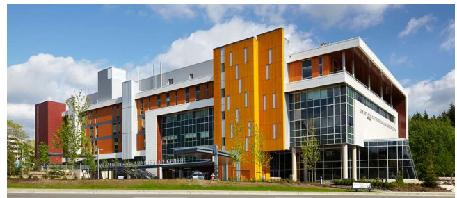
Figure 1: Jim Pattison Outpatient Care and Surgery Centre

Continue reading to learn more about BKL's expert contributions to three recent highlight projects in British Columbia: the Jim Pattison Outpatient Care and Surgery Centre, Port Mann / Highway 1 Improvement Project, and Telus Garden.