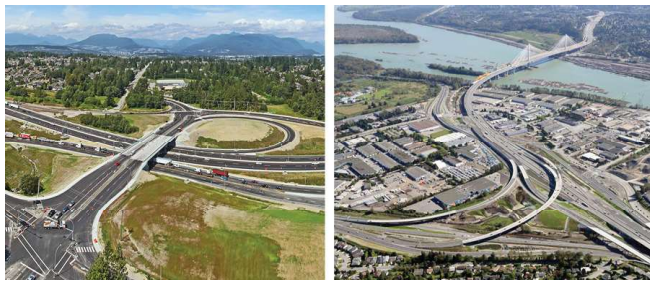
Figure 2: Port Mann / Highway 1 Improvement Project

For this project, BKL took a hands-on approach and ensured the highest standards of quality were met. The team attended design meetings, reviewed shop drawings and carried out site visits to inspect and confirm the correct implementation of the acoustical recommendations. Upon completion, BKL tested noise, vibration, reverberation, sound isolation, confirmed compliance with the project criteria, and obtained LEED point IDC1 as a result.