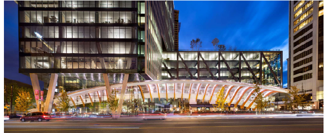
Figure 3: Telus Garden

BKL monitored construction noise and vibration, and consulted on the design of more than 35 noise walls. BKL also monitored post-construction noise to confirm compliance with project criteria, and tested noise barrier insertion loss to ANSI S12.8.