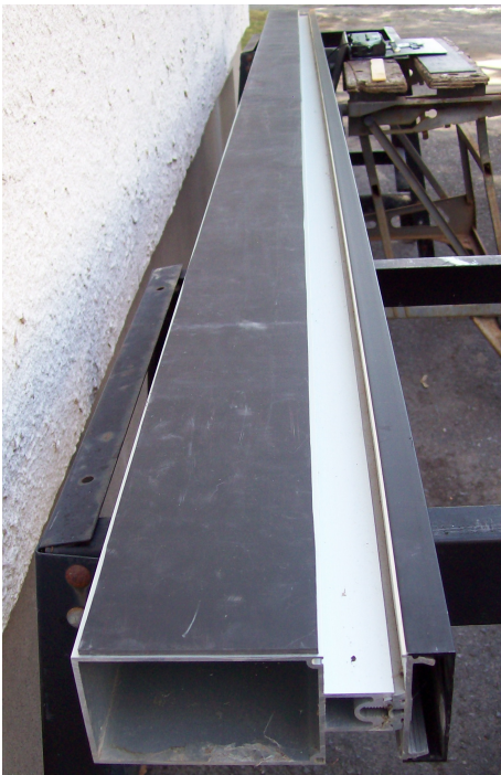
Figure 1: Validation testing setup, with mass-loaded barrier applied to one of the window mullion surfaces.

Finally, the insulation was removed, and tests were completed with one and two of the mullion surfaces covered with a barium-loaded vinyl product, which had been selected for a high surface weight (2.0 lb/ft 2 , or approximately 9.8 kg/m 2 ). The stimulus and measurements were both located on surfaces without the mass-loaded barrier treatment. The acceleration response was reduced by approximately a factor of 2 with two of the three suite-facing surfaces treated, compared to the un-treated condition.