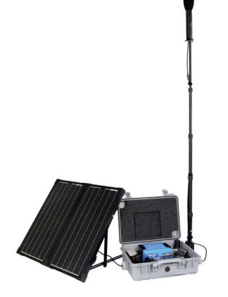
SoundAdvisor Model NMS044