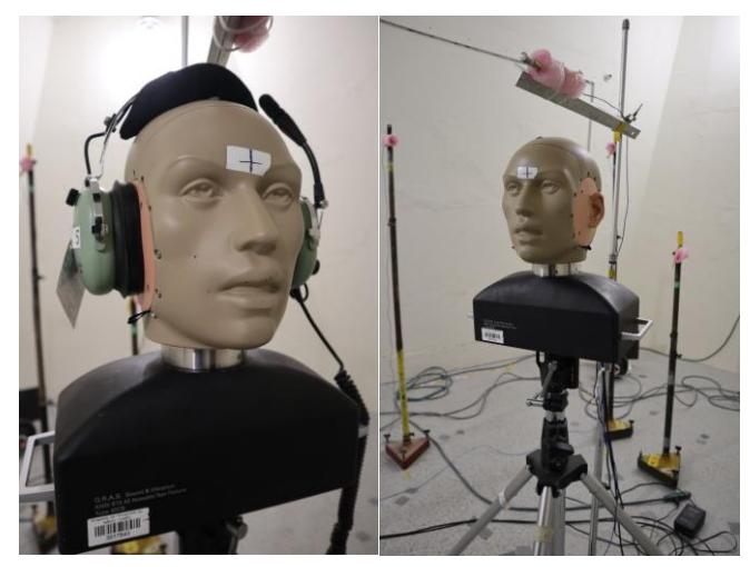
Figure 1: Left: Occluded Ear (with David Clark headset) and Right: Unoccluded Ear configurations.

The two occluded and unoccluded ear configurations are depicted in Figure 1.