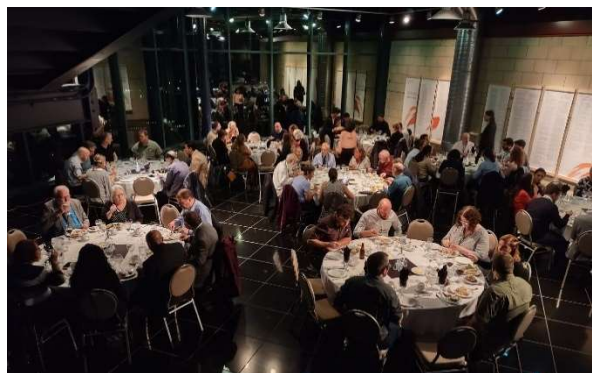
Scenes from the Banquet at The Rooms

We look forward to seeing you all again in Montreal in 2023!