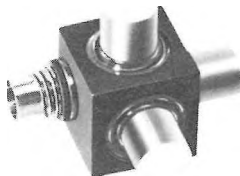
Model 505 Triaxial - High Frequency Low Mass