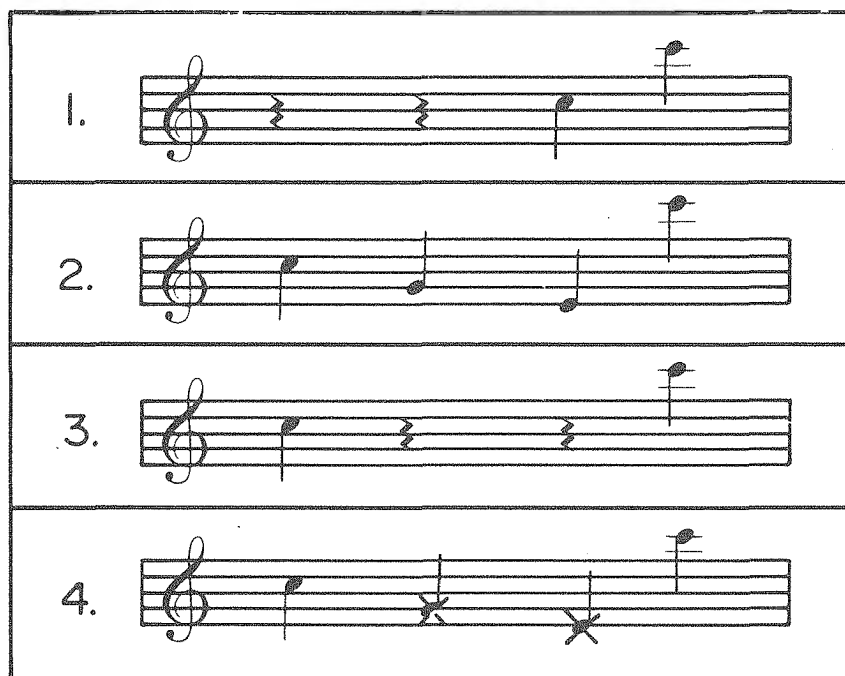
FIGURE 1. The sequence of events for each of the four experimental conditions. The musical notation is given one octave below the actual frequency range used.